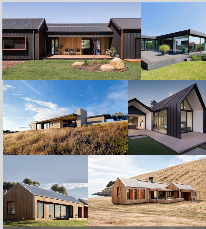
A sample of styles. See more on our Pinterest Page XXX

Please note these are guidelines and we invite all designs which would work with the environment at Stoney Hill.